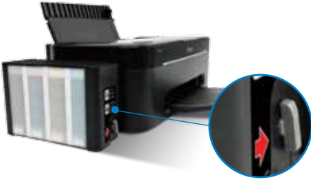
Choke Valve to lock tubes and prevent ink leakage

No more frequent ink refills, clogged valves or wasted ink with Epson Fast Ink Top-up (FIT) Technology. A Choke Valve controls the ink flow and assures you of more value for every ink bottle you use. Simply lock the device when the printer is not in use or when you are transporting to minimise ink leakage or wastage.